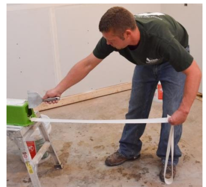
Booking the tape for longer pieces

TapeBuddy makes it easy to tape ceiling joints! Position your bench under the seam you are working on, pull out the coated tape (about 4 to 6 feet) and step onto your bench. Press one end of the tape over the seam and align the other end. Because the mud is on the tape, it will stick instantly. Embed, smooth and you're ready for the next piece. There's no mess or excess compound! See page 13 for more advice on taping butt joints.